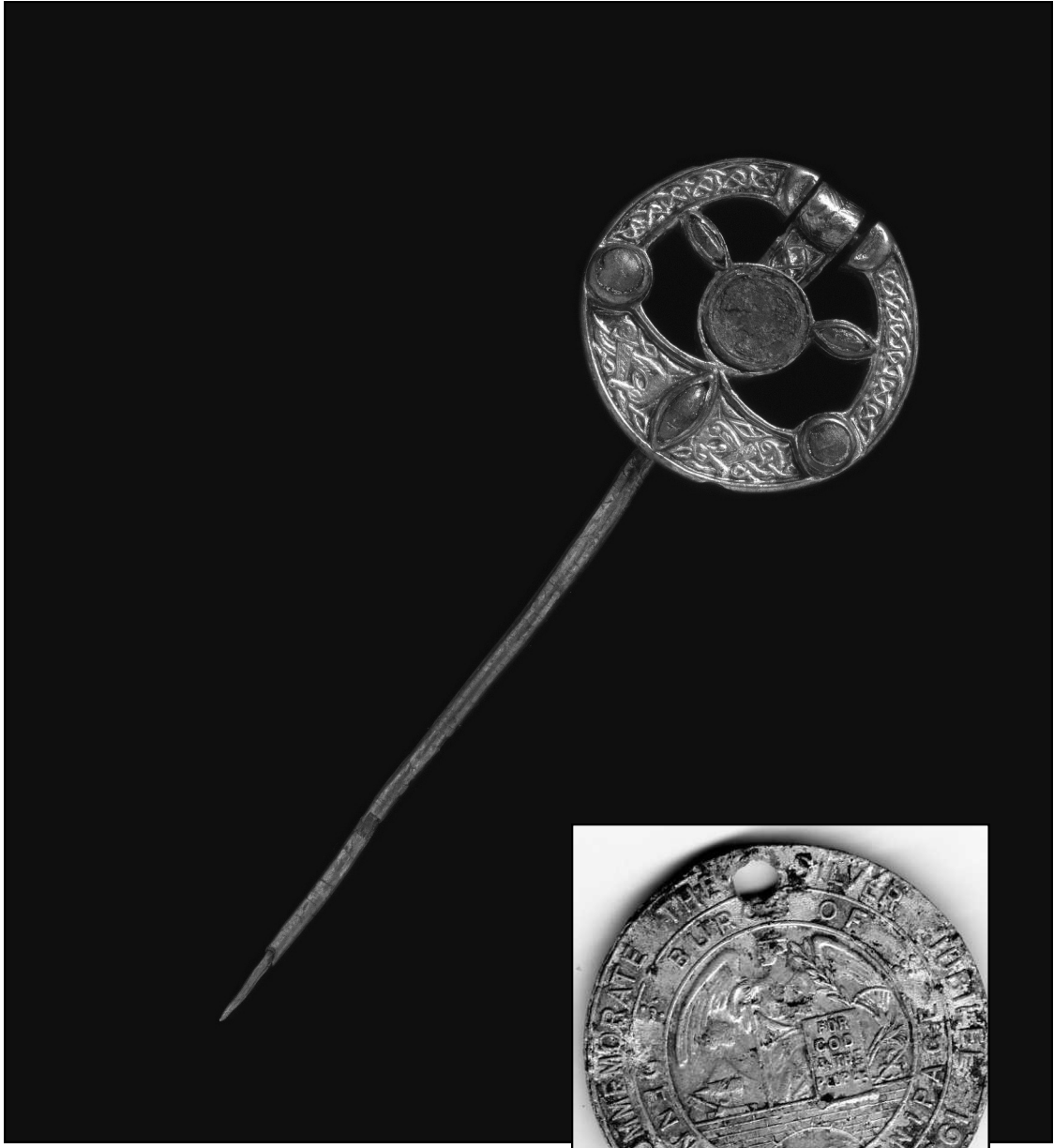
Photo of Dunipace Brooch © Scotlandsimages.com Used with Permission.